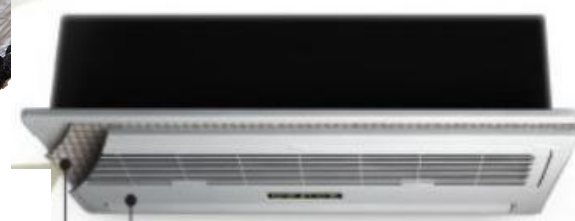
Air conditional seals &gasket insulation